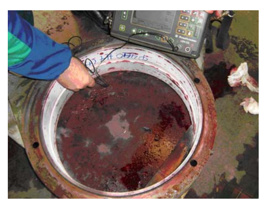
Figure 5. Ultrasound KRAUTKRAMER USN 52 L used by the Institute "INKOS" and ways of controlling the details with it