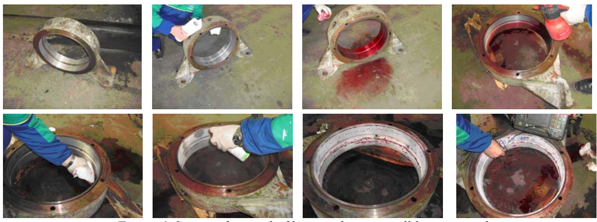
Figure 6. Stages of control of bearing housing will be presented