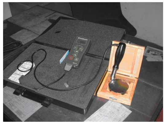
Figure 3. Krautkramer MIC 10 Unit for measurement hardness.

Welding repair of machinery details besides the purpose to improve the geometrical form and obtain again the desirable fits, it also raises the hardness of them. In Palaj, to measure the hardness of repaired details is used the Unit MIC 10 Krautkramer (figure 2). Before measurement, it is necessary that details to be cleaned. Three or more consecutive measures are done and in the end are found the average value. Image of MIC 10 and the way of measuring the hardness of different details is given in the following figure